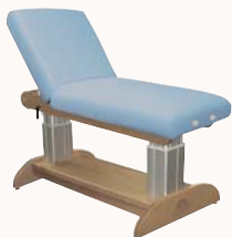
BACK REST TOP

OAKWORKS® CELESTA PERFORMALIFT™ TREATMENT TABLE IS A FANTASTIC SOLUTION FOR PRACTITIONERS OF ALL KINDS, offering unparalleled strength, stability, and many top options for a variety of massage, bodywork, therapeutic manipulation, and esthetic services. The dual pedestal lifting towers house whisper quiet motors with the ability to tilt 15° in either direction, offering incredible comfort and enhanced client access, all controlled with one touch positioning in the hand control. Standard with plush padding and TerraTouch™ Fabric.