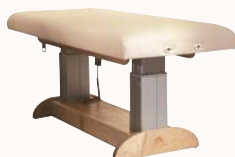
RECTANGULAR OR ROUNDED CORNERS